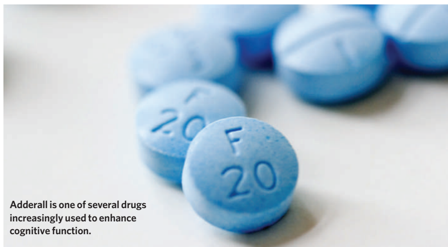
Adderall is one of several drugs increasingly used to enhance cognitive function.

Many of the medications used to treat psychiatric and neurological conditions also improve the performance of the healthy. The drugs most commonly used for cognitive enhancement at present are stimulants, namely Ritalin (methylphenidate) and Adderall (mixed amphetamine salts), and are prescribed mainly for the treatment of attention deficit hyperactivity disorder (ADHD). Because of their effects on the catecholamine system, these drugs increase executive functions in patients and most healthy normal people, improving their abilities to focus their attention, manipulate information in working memory and flexibly control their responses 3 . These drugs are widely used therapeutically. With rates of ADHD in the range of 4–7% among US college students using DSM criteria 4 , and stimulant medication the standard therapy, there are plenty of these drugs on