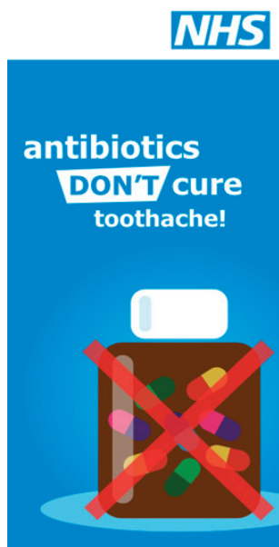
Figure 2. UK Dental Antimicrobial Stewardship Leaflet Cover (16).

Clostridium difficile ( C. diff ) is an anaerobic bacterium which lives in the colon of some patients. Like its relative Clostridium botulinum , C. diff produces toxins when it grows. In the colon, overgrowth of C. diff can occur when an antibiotic targeting aerobic bacteria is taken orally for another condition (such as a dental infection). The bacteria which are sensitive to the antibiotic are killed or disabled by it, leaving behind to flourish those not sensitive to it. This proliferation of C. diff bacteria and its production of toxin is the cause of the antibiotic-related colitis, which can be life threatening if not recognised and treated promptly. C. diff infection (CDI) is associated with considerable morbidity and risk of mortality (20). Signs and symptoms of CDI are presented in Table 2, together