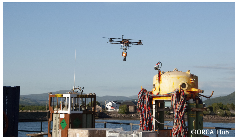
Figure 2. Unmanned aircraft operation near offshore structures.

EXAMPLE: Offshore energy assets, such as wind farms and oil platforms, are dangerous and difficult to access for human workers. Consequently, such activities are also time-consuming and expensive. Unmanned aircraft are increasingly used to perform remote inspection tasks in which different parts of the offshore structure are examined using cameras or touch sensors (see Figure 2).