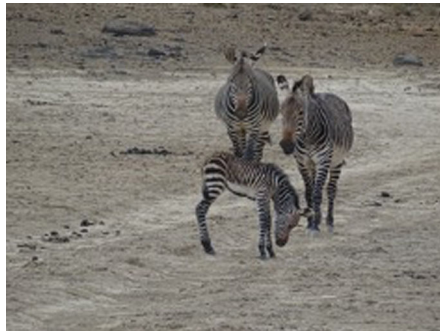
Figure 2. SWR7 at 15:30 where the foal was seen to be standing for a short period before falling down. Furthermore, the foal had sustained a broken neck, this was determined to be the reason the foal was unable to lift its head during observation. The individuals in the background are members of the breeding group.

SWR7 was first seen on 19th January 2019. The female foal was aged 3–4 days old. The foal was first seen lying down at 12:00 being guarded by the mother. The foal was later seen standing for a short period with its head pointed downwards and seemed unable to lift its head (Figure 2). The foal subsequently died and was retrieved on the 20th January 2019. A necropsy revealed the foal had sustained a broken neck and massive internal trauma with broken ribs. Four months prior to the birth of SWR7, the stallion was usurped by a new male. The foal was therefore unlikely to be the offspring of the new male. However, no interaction was witnessed to know whether a male or a female committed the attack. SWR7 belonged to a group of 7 individuals, composed of 5 females and 1 male and SWR7. The single-male group of SWR7 was known to use a supplementary feeding site, no other group is known to permanently use the area.