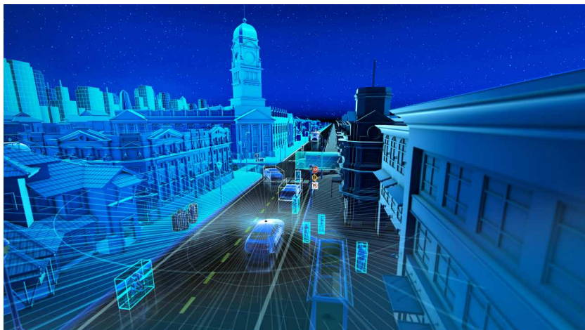
Figure 3.1. A stylised rendering of how lidar “sees”, or senses, an urban environment.

forest cover, or urban terrain, lidar has been used as a principal sensing system to map driving environments, and aid the detection of other road users, signs, and lines.