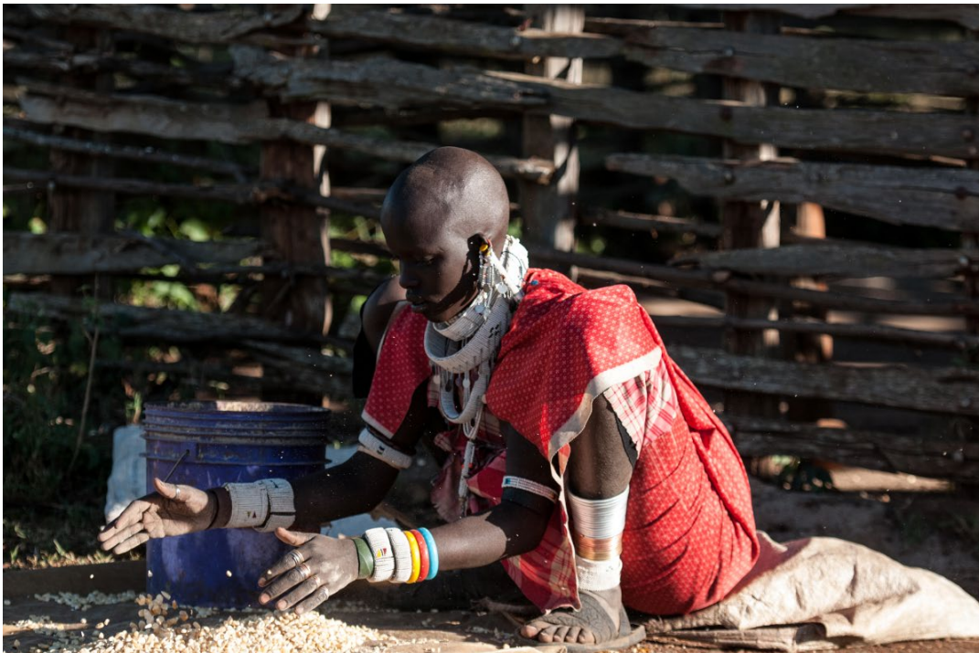
Kisongo Maasai woman preparing maize for grinding, Ngorongoro

“I have been working as a watchman for many years, but the money I make goes to feed my father's wives because he is poor and is not able to sustain the family alone. I wish I could get married so at least my money would go to sustain my own wife and children, but I don't know when and if I will be able while I still have to buy maize for the family.”