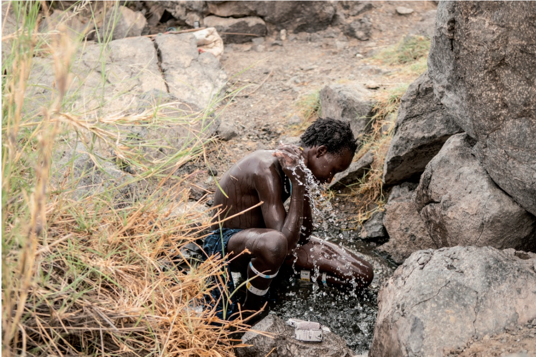
Young Maasai man washing at a spring, Ngorongoro