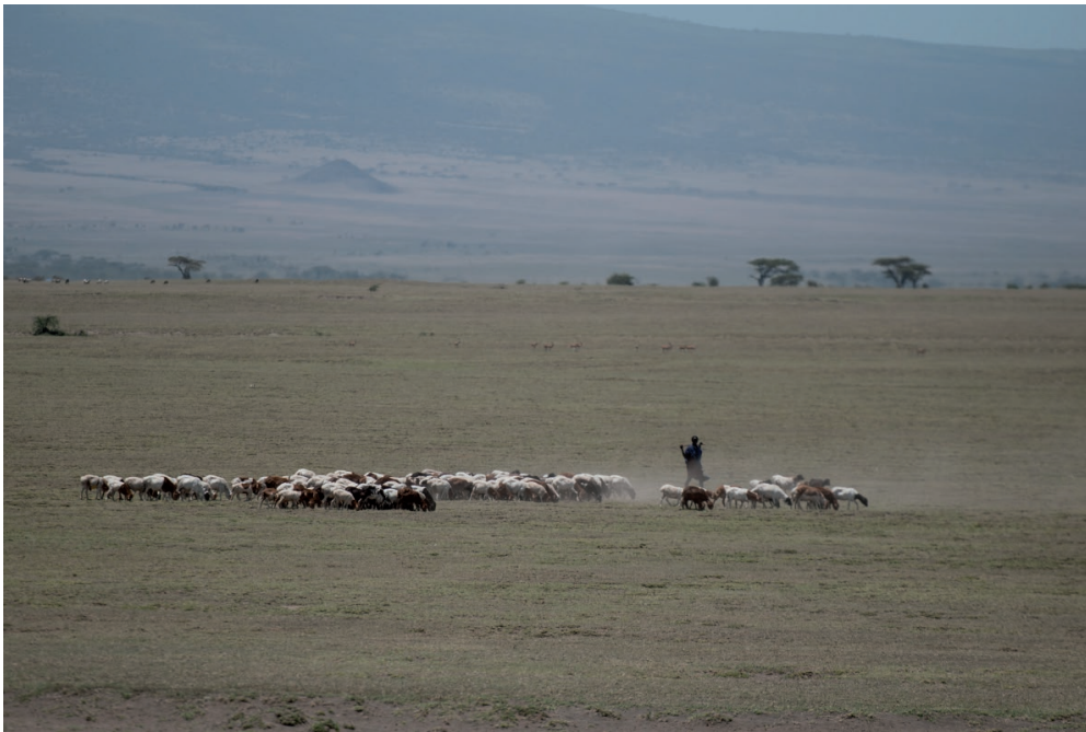
Taking the sheep and goat herd to water, Ngorongoro