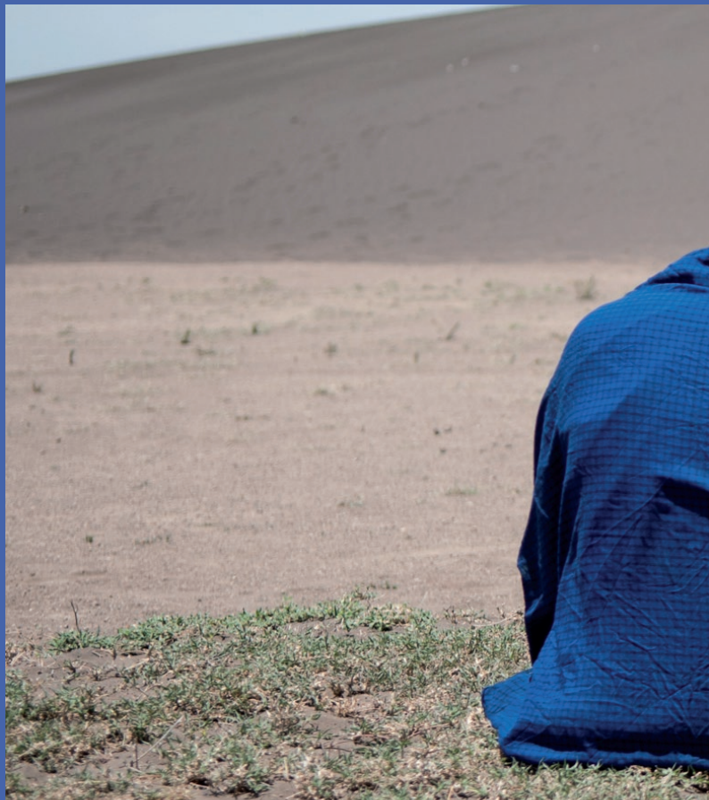
Kisongo Maasai women, Ngorongoro

This research was funded by UK aid from the UK Government, however the views expressed do not necessarily reflect the views of the UK Government.