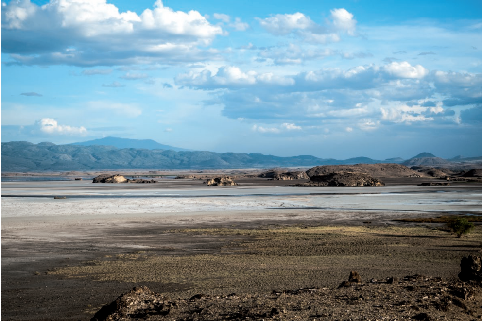
Maasai boma on the shore of Lake Natron