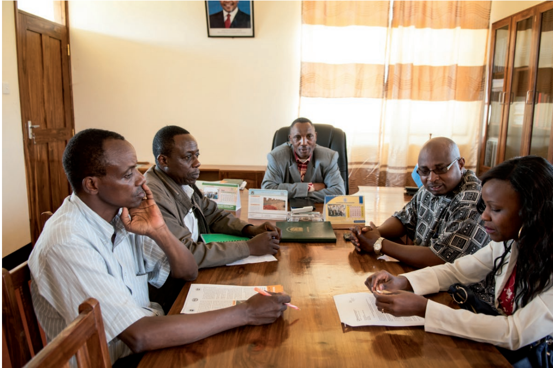
Ngorongoro District Council staff meeting

when the planning is to take place to ensure it fits in with their own plans and calendar of activities. Furthermore, due to a lack of resources the implementation of the O&OD process can be limited to a few activities involving just a few community representatives. As a result, certain segments of society are not adequately consulted (e.g. women and children, local leaders).