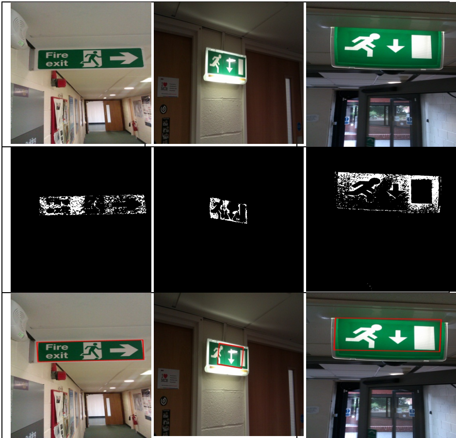
Fig. 3. Row 1: Original Exit sign Image; Row 2: Backprojected Image; Row 3: Tracked region of the exit image

The first row of Fig. 3 shows images of emergency exit signs captured with an Android camera phone. As explained in Section 4, the model histogram that was saved offline is loaded at run-time to perform histogram backprojection on the input images. The result of this operation can be seen in row 2 of Fig. 3. Following this, CAMShift uses the probability distribution image to search for the peak location which corresponds to the location of the searched object and thus return the tracked region. The result of the tracking operation using CAMShift is shown in the last row of Fig. 3.