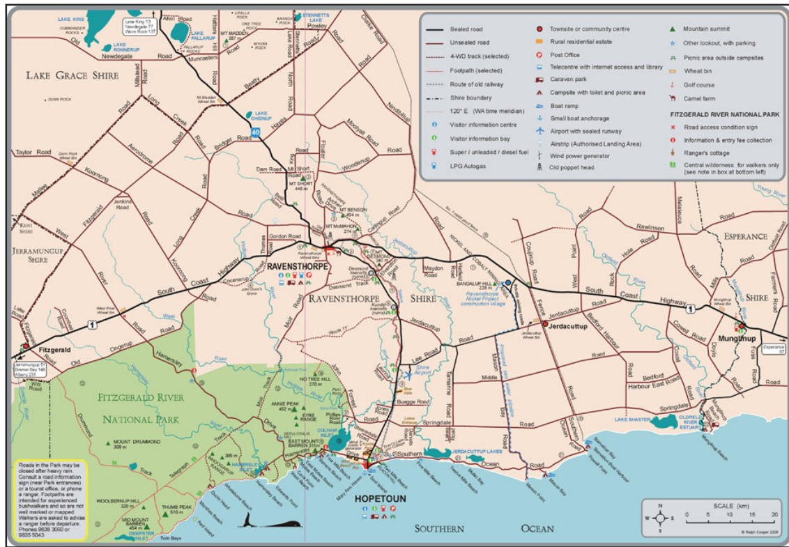
Figure 1. Map of Ravensthorpe-Hopetoun District.

town of Ravensthorpe, the Jerdacuttup farming community, some 35 kms from Ravensthorpe, and a small community by the sea, Hopetoun, some 50 kms south of Ravensthorpe (see Figure 1). The Shire also contains a UNESCO listed biodiversity hotspot, the Fitzgerald River National Park.