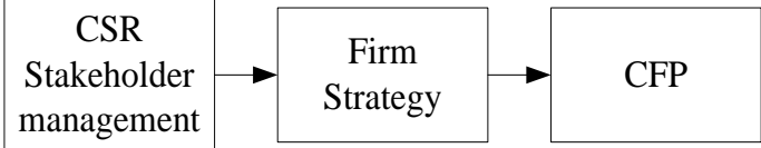
Model 3: The Intrinsic Stakeholder Commitment Model