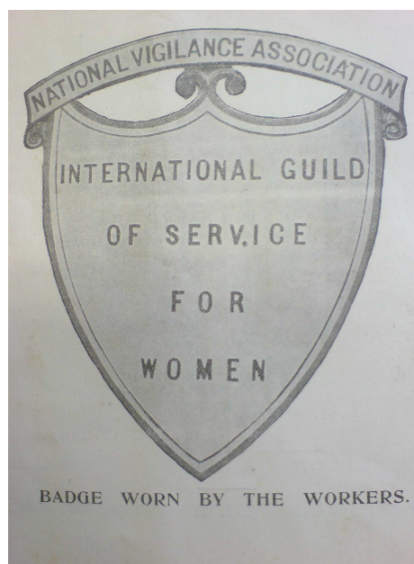
Figure 2.1: LVA Badge 24

Though the badge held no official significance because it did not connote any form of objective authority, it served to differentiate LVA workers from ordinary members of the public. As an emblem of trust and guardianship, it conveyed a sense