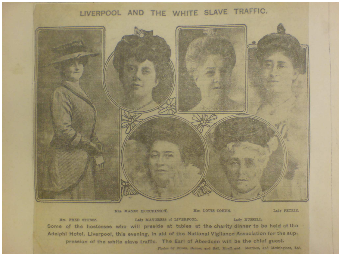
Figure 3.1: Liverpool and the White Slave Traffic 24

The headline 'LIVERPOOL AND THE WHITE SLAVE TRAFFIC' sat somewhat oddly with the accompanying photographs of well-groomed and elegantly-dressed middle-aged women. Yet these images represented an integral part of the white slave campaigns of these local purists. The women depicted were the very antithesis of white slavery, not simply because of their opposition to the trade but because of their backgrounds. As representatives of white, middle-class respectable femininity they epitomised everything that the potential white slave was