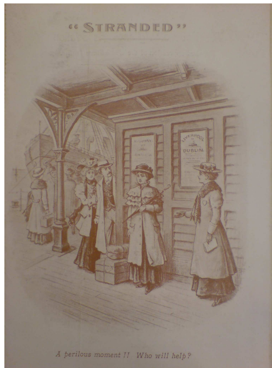
Figure 3.3 “Stranded”: An LVA Illustration