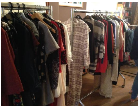
Figure 3 – rails of clothes

three items and leave with ten that is part of the ethos. Nor is it only clothing which is brought along, but shoes, accessories, and also jewellery; all of which is laid out and ordered around the downstairs of Rebecca's home. In the one I attended, Rebecca had clothing rails in her living room with dresses, jeans, trousers and tops all separated out (see Figure 3). Jackets and coats were on another rail in the hallway. In the playroom were accessories, with handbags arranged on top of a book shelf, and scarves folded neatly on the piano (see Figure 4); whilst in the kitchen, jewellery was arranged on her kitchen table (see: Figure 5), and shoes were sorted along a bench (see Figure 6), along with crisps and drinks available on the kitchen island. As I will go on to discuss, this element of display was important in the way that attendees engaged with the clothes and each other.