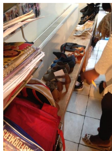
Figure 6 – shoes on the kitchen bench

As Rebecca explains the 'rules' of the clothes swap are as follows: