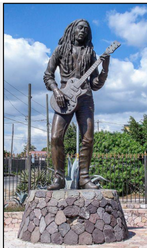
Statue of Bob Marley in Kingston, Jamaica.