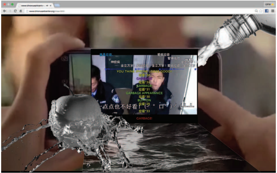
Miao Ying, Aifeng laji 爱疯垃圾 [iPhone Garbage], 2014. Browser-based (GIFs, video-sharing website, still image).

with status, success, and bright futures. In times of corporate social-networking platforms, viral infotainment, and participatory media, the Diaosi phenomenon brings visibility to a group of young people rendered otherwise invisible by a society in which success is often predicated solely on educational achievements and material wealth, and in which the fetishization of the commodity has usurped every value except the power of the state. 42