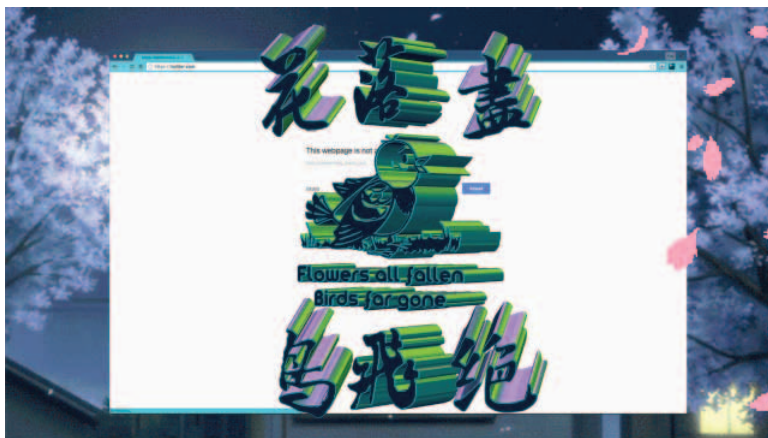
Miao Ying. Juyuwang qingshi—Hua luo jin, niao fei jue 局域网情诗-花落尽,鸟飞绝 [LAN Love Poem—Flowers All Fallen, Birds Far Gone], 2014. GIF animation, 5,000 × 2,812 pixels, 16:9.

and standardization of the “global” Internet, in which regional variations are gradually eroded in favor of a universal pictorial language.